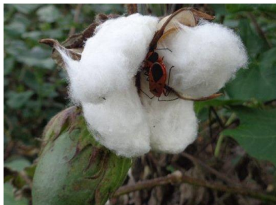
Figure 3 Cotton

The “from fabric to readymade garment” process in a nutshell: