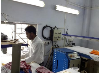
Step 6. Pressing/ironing