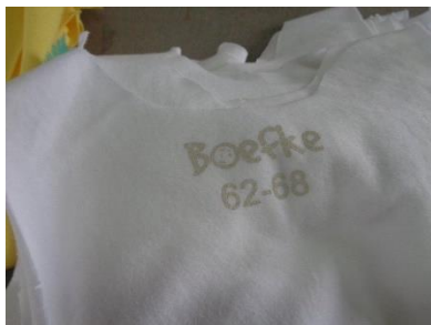
Step 3. Printing label