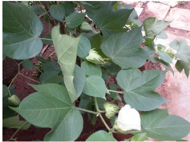
Figure 1 Cotton flower

After each order we place, we visit our partner in India twice during the entire process, to see with our own eyes what is happening. During the visits we learn a lot about Organic Cotton textiles. We would like to share what we have seen on site, with pictures we have taken there.