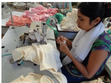
Step 5. Stitching