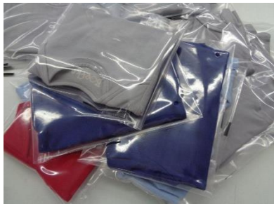
Step 8. Packing

For printing, we use only GOTS approved paints. Printings are handmade, with a printscreen.