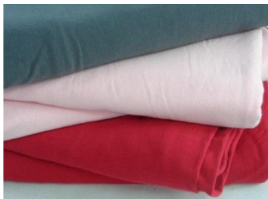
Step 1. Fabric in Boefke colors

The “from fabric to readymade garment” process in a nutshell: