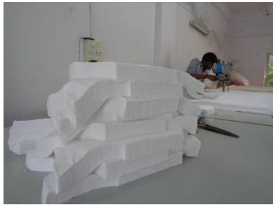
Step 2b. Cutting done