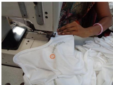
Step 4. Piping