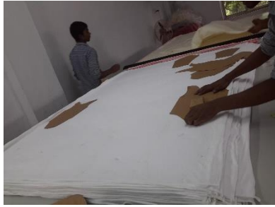
Step 2. Cutting