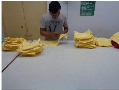
Step 7. Finishing