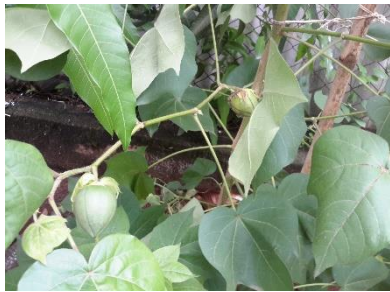
Figure 2 Cotton fruit